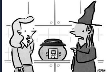
"It's one of those new Instant Cauldrons. You put a kid in here with some eye of newt and an hour later it's the best thing you've ever eaten."